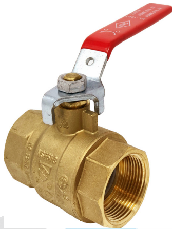
600 WOG FULL PORT FORGED BRASS BALL VALVE THREADED ENDS